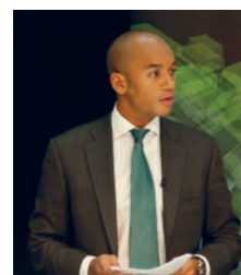
By Chuka Umunna MP

Chuka Umunna is the MP for Streatham and Shadow Secretary of State for Business, Innovation and Skills