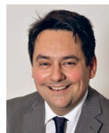
By Stephen Twigg MP

ventured into a previously policy-free territory by introducing a new focus on Early Years provision. Labour can be proud of the advances that were made in government. From securing a universal entitlement for 3 and 4 year olds, to introducing the Early Years and Foundation Stage curriculum, a policy step change was achieved. As we go forward with our Policy Review, we need a renewed radicalism to build on the foundations we left behind.