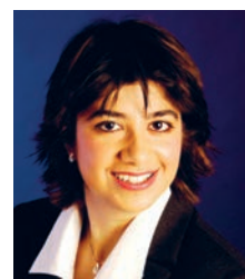
By Seema Malhotra MP

Seema Malhotra is the MP for Feltham and Heston and the Director of the Fabian Women's Network