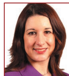
By Rachel Reeves MP

Rachel Reeves is the MP for Leeds West and Shadow Chief Secretary to the Treasury