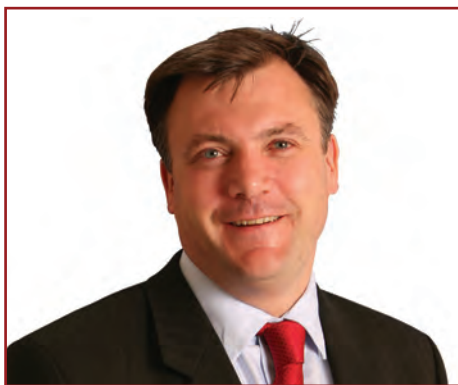
Shadow Chancellor Ed Balls MP

You have to start by having authentic women's voices at all levels of the party, from the leadership and shadow cabinet right down to our marginal and safe seat candidates. We've made massive progress on that in the last decade.