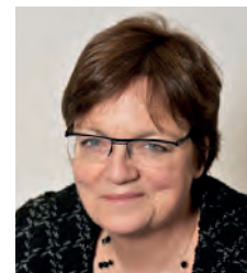
By Fiona Mactaggart MP

Fiona Mactaggart was elected MP for Slough in 1997 and founded the All-Parliamentary Group on Prostitution and the Global Sex Trade, and is joint secretary of the All-Parliamentary Group on Human Trafficking.