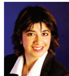
By Seema Malhotra

Seema Malhotra is the Labour Co-operative MP for Feltham and Heston and the Director of the Fabian Women's Network.