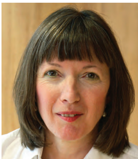
Frances O'Grady is the General Secretary of the TUC

a serious policy for jobs and growth: our economy must be more balanced to work for ordinary working people. It is also time to create decent green jobs. Second, we need to invest in wages and living standards: wages have stagnated since 2003."